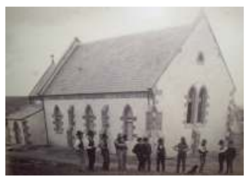
Barrabool Church 1884

The payment of pew rents was the traditional way of raising funding for the Church, vastly different to modern methods of BPay payments and electronic transfers. Pew rents was an English method imported to the