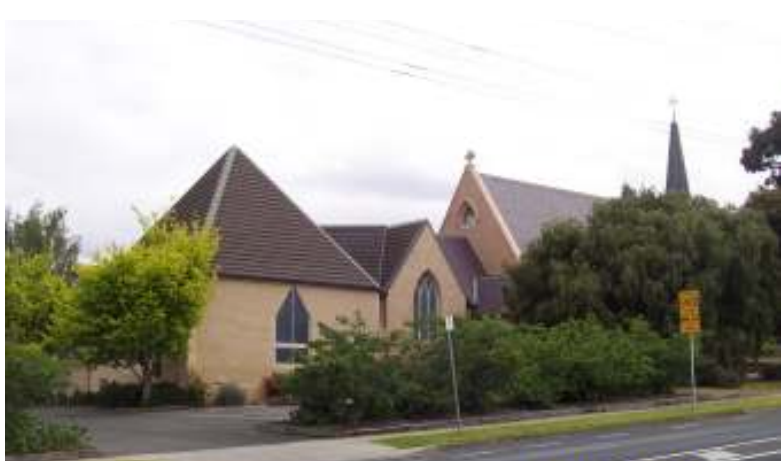
View from Roslyn Road in 2008

Diocesan Year Book of 1867 lists grants of £270 for the Church, and £65 for the stipend.