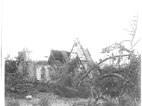
Destruction caused by the 1926 Fornado