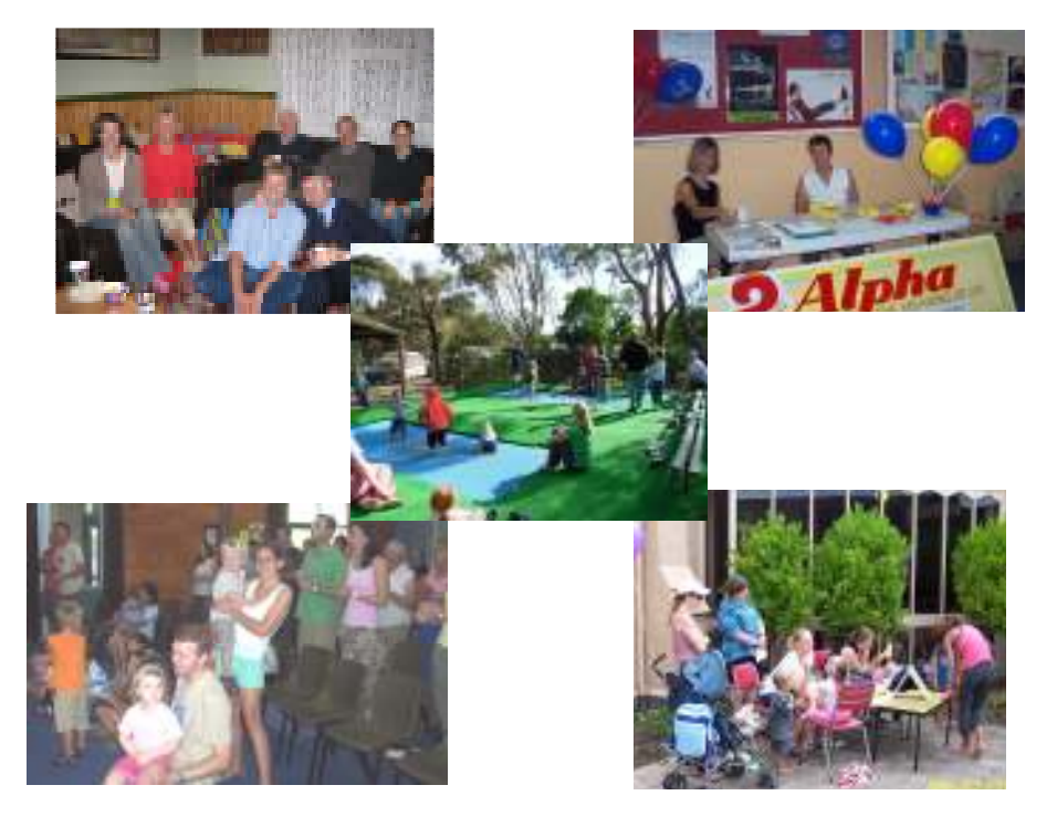
Building People for God in 2008