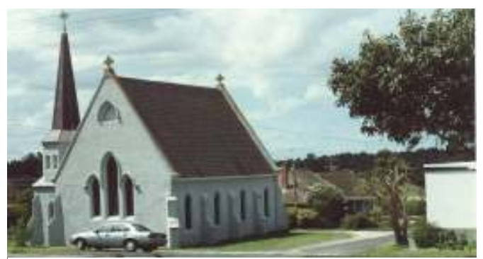
View from South Valley Road before the 1990 extensions

Seating capacity issues emerged during this period. The leadership team of St John's would spend several years grappling with how the capacity issue could be satisfactorily resolved. The idea of expanding the church building occurred during this time. In 1986 the mid-morning service was moved from the church to the church hall as a result of overcrowding. During 1987 the vestry discussed and canvassed views from the parish for the possible construction of a new worship centre to solve the overcrowding issues for some services and anticipation of future parish needs. A large amount of prayer events occurred at this time. On April 5 a special parish meeting was called to discuss the proposed new 'worship centre'. The motion was put to a vote and was carried overwhelmingly. Over the next couple of years, the vestry dealt with a number of issues connected with the new worship centre – in particular the planning and financial aspects of the development.